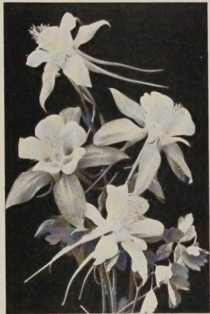
Long Spurred Columbine

All these SPECIAL PLANT OFFERS listed here will add beauty and color to your garden next year. These perennial plants have been grown at our nursery in the Pocono Mountains, and are, therefore, very hardy and well adapted to Northern climatic conditions. Each SPECIAL OFFER represents the finest in field grown plants, both with relation to size and quality. Select several SPECIAL OFFERS and plant this Fall. You will be more than pleased when they bloom next year. Please order by letter preceding plant offer. All plants shipped postpaid within a 500 mile radius of New York City.